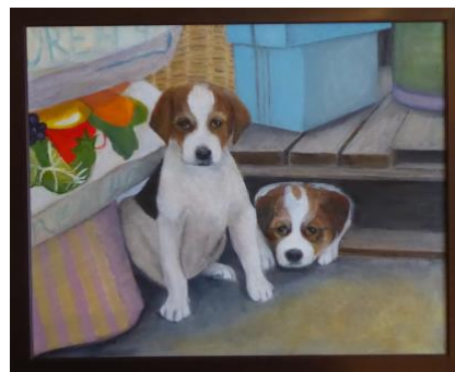
Puppies in Sicily, by Valerie Zito

This month's meeting will feature YOUR art.