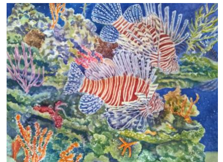
"Red Lion Fish" by Elizabeth Kennen

(REMINDER: The links may not work from a PDF document, you need to copy and paste it or type it into your browser. )