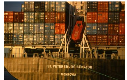
"Busy Day" by Phyllis Couillard

(REMINDER: The links may not work from a PDF document, you need to copy and paste it or type it into your browser. )