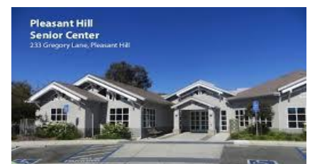
Exhibit exchange is Nov. 19 th . New show "Bright Colors"!