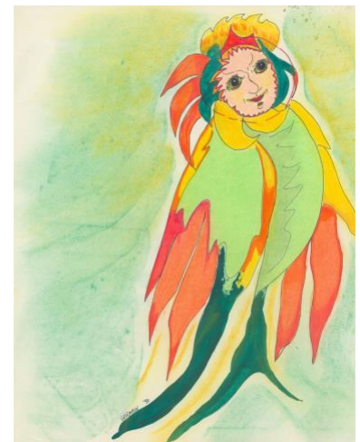
“Orange Elfin” by Bonne Germain

(REMINDER: The links may not work from a PDF document, you need to copy and paste it or type it into your browser. )