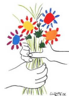
"Petit Fleurs" by Picasso