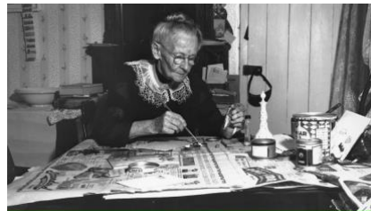
Anna Mary Robertson Moses (September 7, 1860 – December 13, 1961), Grandma Moses was an American folk artist.

Share images of your favorite artists with members