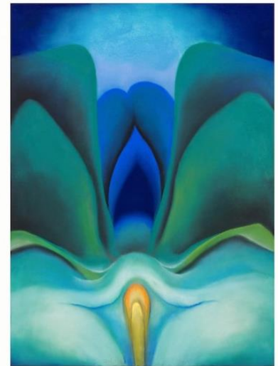
Blue Flower, Blue Abstract, 1918 by Georgia O'Keeffe

(REMINDER: The links may not work from a PDF document, you need to copy and paste it or type it into your browser. )