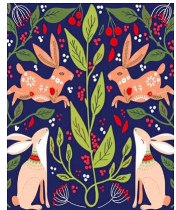
Bunny folk art - animals paint by number