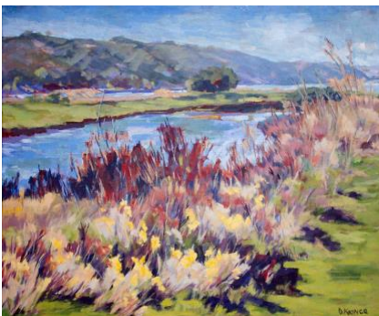
"Shoreline View" by Debby Koonce

A painter of landscapes who specializes in the exploration of the uses of light and shadow in oil and acrylic media.