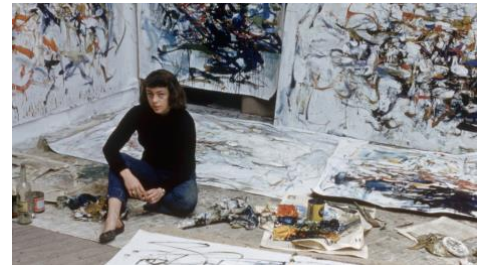
Joan Mitchell (1925-1992) In Her Studio, © 1956

(REMINDER: The links may not work from a PDF document, you need to copy and paste it or type it into your browser. )