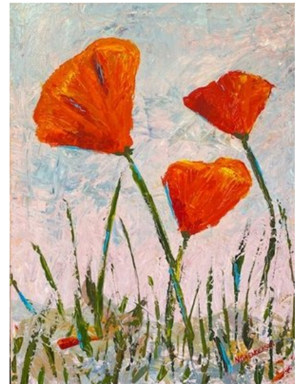
Poppies, Nancy Henderson

(REMINDER: The links may not work from a PDF. You will need to copy and paste it or type it into your browser. )