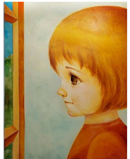
"Untitled" Joo Chase

"Art is the only way to run away without leaving home." ~Twyla Tharp